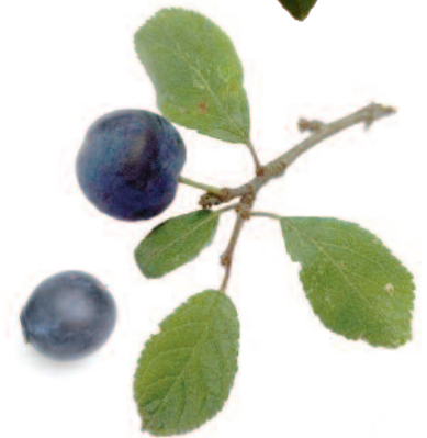
Blackthorn Prunus spinosa

Take care – some fruits and seeds are poisonous to humans!