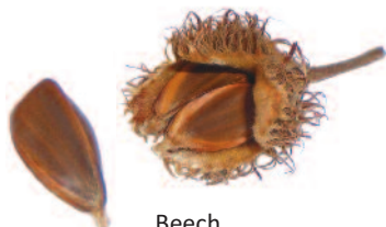
Beech Fagus sylvatica