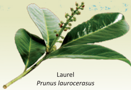
Laurel Prunus laurocerasus