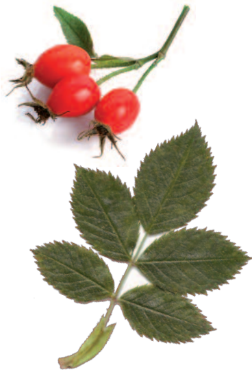
Dog Rose Rosa canina