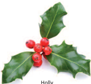
Holly Ilex aquifolium