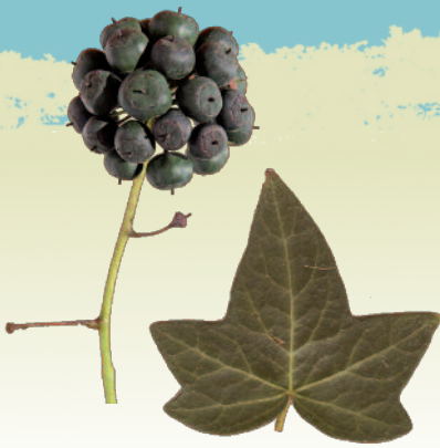
Ivy Hedera helix