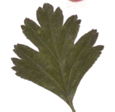
Hawthorn Crataegus monogyna