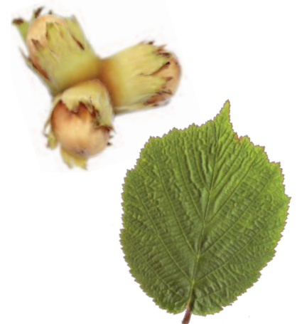
Hazel Corylus avellana